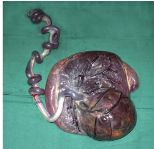
Fig 1 : Gross Appearance Of Chorioangioma

discharged on post - op 4 day. Histopathological examination revealed chorioangioma with 4 vessels in umbilical cord.