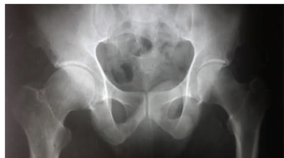
Fig 1: X-ray pelvis taken at the time of onset of hip pain

His pelvis X-ray taken at the time of onset of hip pain was normal (Fig.1). His Xray at the time he presented to me, that is, 8 months following the onset of symptoms showed displaced fracture Neck of Femur bilaterally