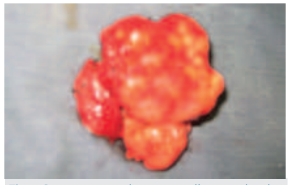
Fig 3: Gross specimen showing a well encapsulated mass