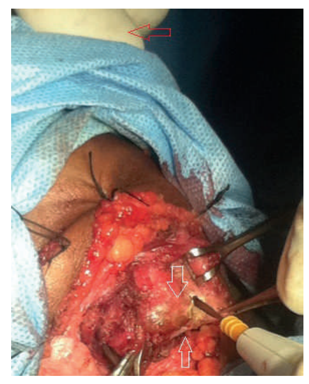
Fig. 3: Intraoperative picture showing Lingual thyroid mass ( \downarrow ) pushed into suprahyoid space using a finger guide in oral cavity ( \leftarrow ). ( \uparrow - hyoid bone)