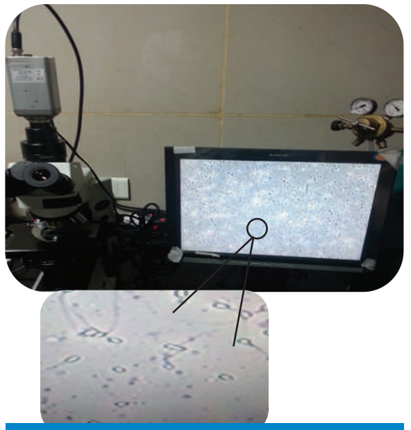
Fig 2 - Setup for observing immotile spermatozoa

Semen analysis was performed according to WHO 2010 by focusing in one 40x field and the microscope was attached to monitor connected with the camera (Figure 2).